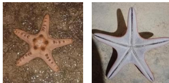
Figure 3. Protoreaster nodosus

This species is found in seagrass beds quite far from the coast. It lives hidden under the cover of seagrass branches, tends not to live in groups, and is only occasionally seen in proximity to other individuals. Ernawati et al. (2019) stated that Protoreaster nodosus is a species of the class Asteroidea that prefers specific microhabitats such as seagrass beds. Seagrass habitats are used by Protoreaster nodosus as places to shelter and forage. The types of food consumed by Protoreaster nodosus in seagrass areas include decaying seagrass leaves, microbes, macroalgae, and detritus.