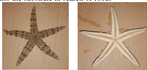
Figure 2. Archaster typicus

This species of starfish tends to live in groups when found, but some individuals are also found alone, quite far from their group. This species is found in seagrass beds, but some individuals bury themselves in the sand between the seagrass stalks. Neno et al. (2019) stated that Archaster typicus efficiently consumes several foods in the form of detritus, like other types of starfish, and lives mostly in sand. This species is nocturnally active and can move large amounts of sand into the substrate in search of food.